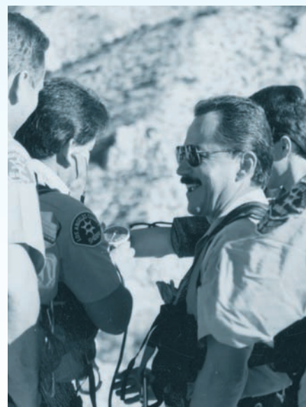
Health and safety concerns are part of a successful rescue.

The EVOC staff, comprised of one Sergeant and eight deputies, provides both basic and advanced driver training to sworn and civilian personnel. EVOC is based at the County Fairgrounds in Pomona. Both pursuit driving and vehicle recovery (the Skid Pan) are taught in the parking lots of the fairgrounds. EVOC has a full compliment of interactive video driving simulators that teach driver awareness, vehicle control and hazard avoidance in a classroom setting.