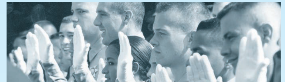
Swearing in new deputies at graduation.

During 1999, the Recruit Training Unit was able to train and graduate 341 "off the street" recruits and 105 "Modified Deputies." Additionally, the Recruit Training staff trained and graduated 276 Custody Assistant recruits.