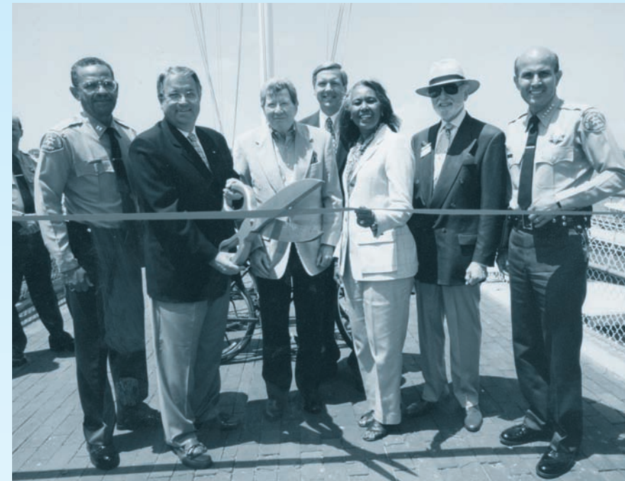
August 6, 1999, celebrating Marina Del Rey's restoration to a full service Sheriff's station.

Team member responded to a vehicle in the water off of Via Marina with persons trapped inside. The diver entered the water, in uniform, within 5 minutes of the call. However, both persons were presumed dead from the impact of the collision. Additionally, they provided presentations about the Dive Team to various community groups, schools and other agencies.