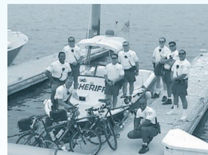
Marina Del Rey's Summer Enforcement Team (Above) and Marina Del Rey Station's policing area (Left).